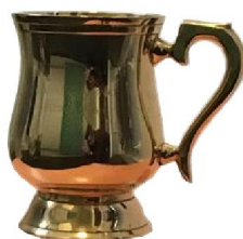
Year's best specimen fish (Chub)