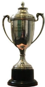
Heaviest fish caught in contest