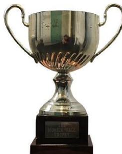
Highest aggregate pts, Evening Scrambles