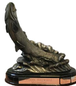
Winner "OAP" contest